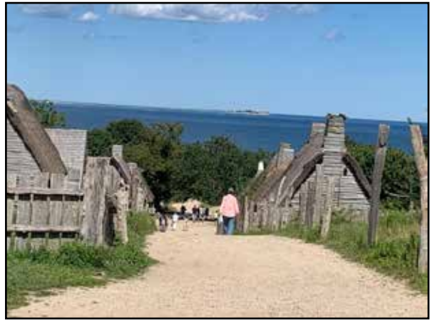
Above: Plymouth Plantation

Next year the General Board of Assistants meeting will be in Bloomington, MN.