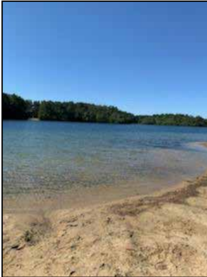
Above: Billington Sea