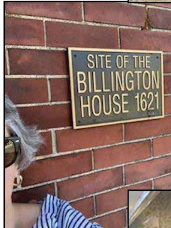
Below: Plymouth Plantation